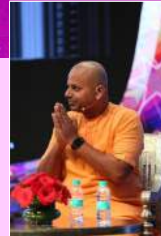
Motivational Speaker Shri. Gaur Gopal Das