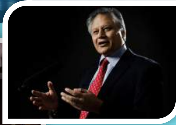
Motivational Speaker Mr. Shiv Khera