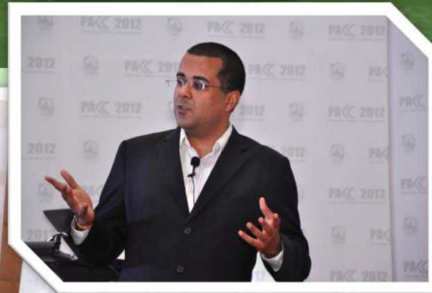
Motivational Speaker Mr. Chetan Bhagat